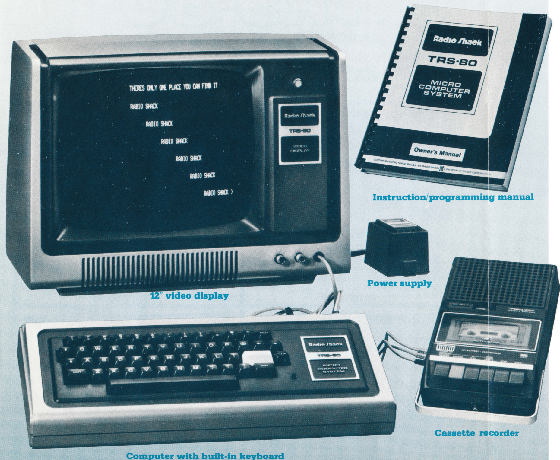
12" video display